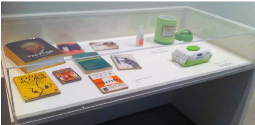
Public education of the harm of anti-trafficking campaign: exhibition and performance at the AGO.

We urge the public to pay close attention to the ways that anti-trafficking measures and repressive legal policies impact sex workers. The climate of fear created by repressive laws and anti-trafficking campaigns means that the sex industry is driven further underground, resulting in more sex workers choosing work locations that are less visible and offer fewer safety protections.