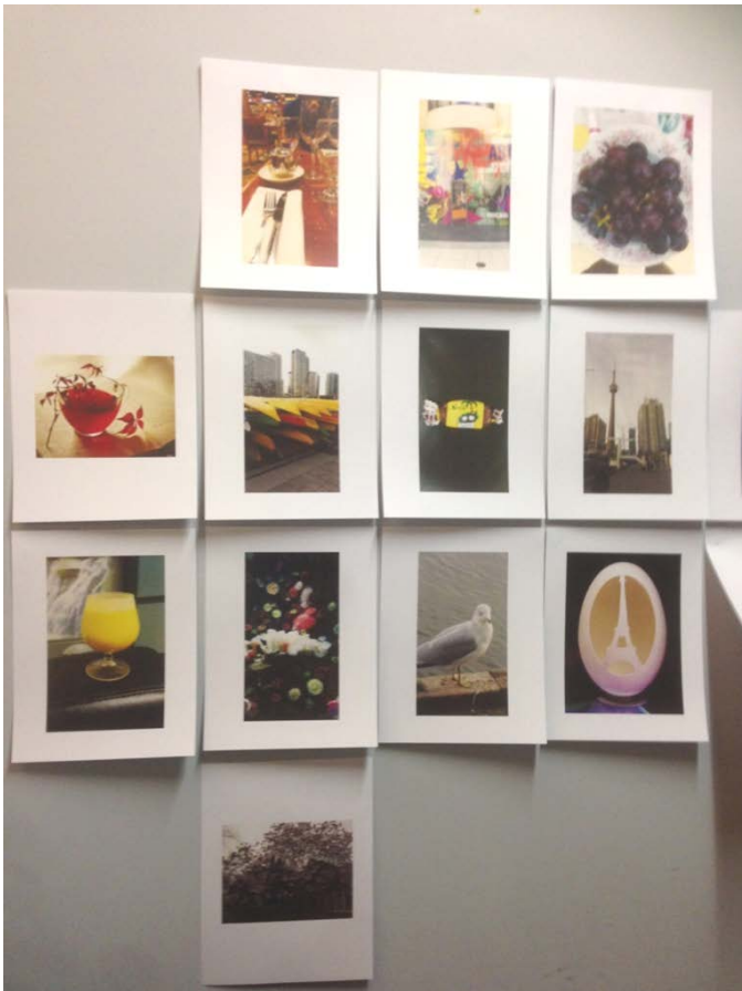
Art exhibition with photographs by sex workers, shedding light on different aspects of their lives.

complexity of people's lives and the choices which they make given their available options. For those who are restricted in their opportunities to work and live in Canada, and who may not be able to access regular channels of work, sex work can be a way of gaining more freedom and independence. The same goes for those who do not want to work in an exploitative environment (such as long working hours, low wages, and bad working conditions), or need to save finances to leave an oppressive marital relationship. For many people, sex work is the best available option in terms of flexibility, payment and working conditions.